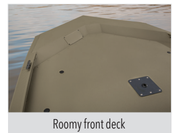
Roomy front deck