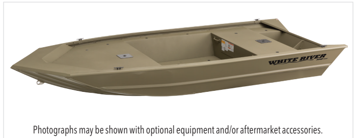
Photographs may be shown with optional equipment and/or aftermarket accessories.